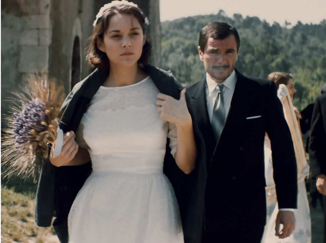
Nicole Garcia's Mal de pierres (From the Land of the Moon) will screen on Aug. 21 at Place de la Paix as part of Cinemania's summer screenings.