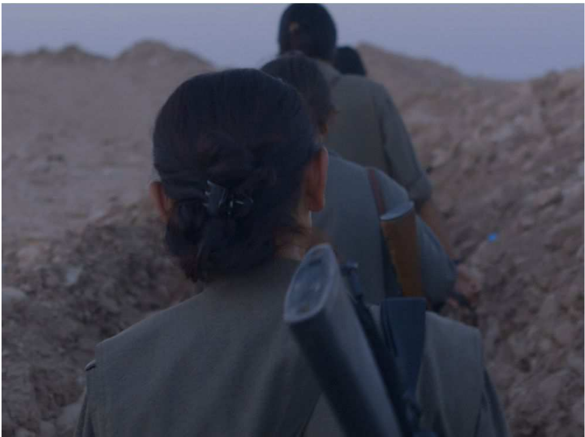
Zaynê Akyol's documentary Gulîstan, terre de roses tracks a small group of guerrillas deep in the hills of Kurdistan as they prepare to engage in conflict. The film will screen on July 4 at 9:15

RIDM en plein air. Montreal's preeminent documentary festival's summer program features five films in six venues, including: Gulîstan, terre de roses (in Kurdish with French subtitles), Montrealer Zaynê Akyol's intimate portrait of female Kurdish PKK resistance fighters, July 4 at 9:15 p.m. at Pelican Park; and Combat au bout de la nuit , Sylvain L'Espérance's in-depth look at the recent upheaval in Greece, in two parts, Aug. 16 at 8:30 p.m. and Aug. 23 at 8:20 p.m. at Laurier Park. ridm.ca (http://www.ridm.ca/en/)